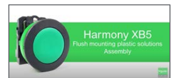
How to video